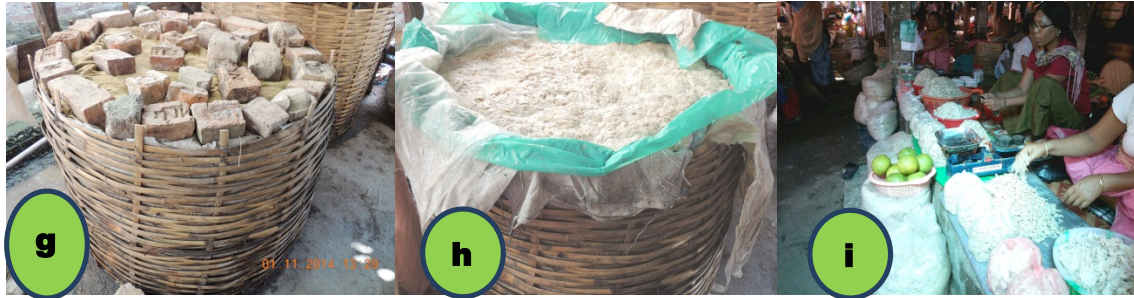
Figure 2: Traditional method Kakching soibum production. a) Fresh bamboo shoots with outer sheaths removed. b) Slicing of tender bamboo shoot into small pieces. c) Bamboo shoot pieces submerged in water in plastic tub and allowed to ferment in open. d) Partially fermented bamboo shoots packed into plastic bags. e) Bamboo shoots from plastic bags put into large bamboo basket. f) Bamboo shoots in the basket are tightly pressed and covered with plastic sheets. g) Bricks and stones placed at the top to put enough weight for sufficient draining of liquid at the perforated bottom layer. h) The cover is open after incubating around 5-6 months. i) The fermented bamboo shoot “ soibum ” being sold in local market.