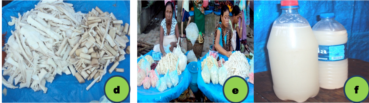
Figure 3: Bamboo based local fermented foods. a) Fresh bamboo shoots without hard outer sheaths. b) Shredded bamboo shoots fermented in plastic sheet lined container in Bishenpur . c) Earthen pots used in bamboo shoot fermentation in Andro . d) Fermented bamboo shoot product “ soidon ”. e) The fermented bamboo shoot products sold in local market. f) Fermented bamboo liquid “ bastangapani/soijim/eup ”.