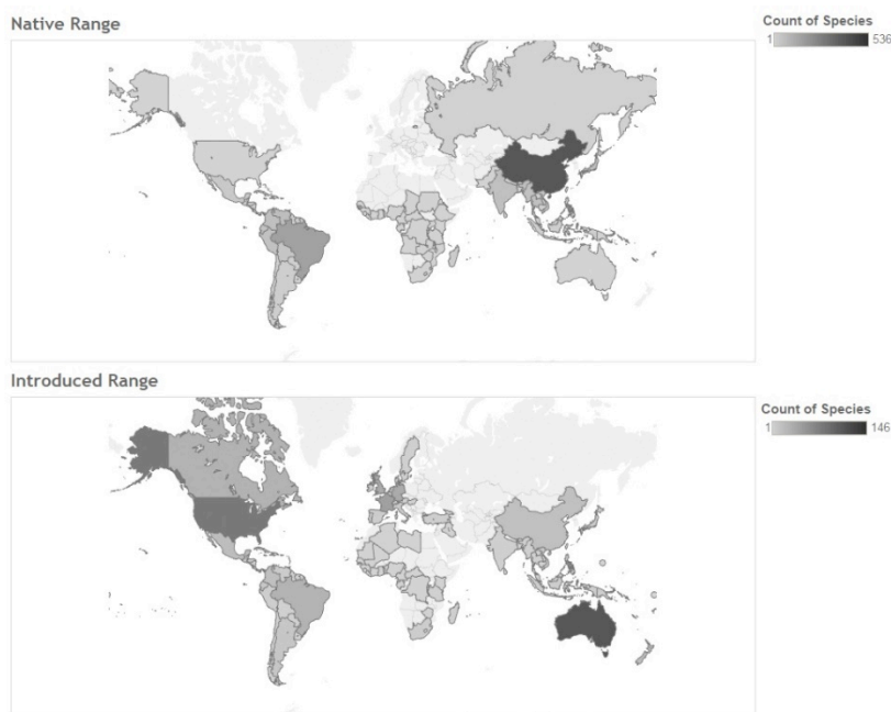
Fig 2. The native and introduced range of bamboo species. There are 1,404 species of bamboo, 150 of which have been moved outside their native ranges. Data are from numerous sources, mainly Kew's GrassBase and the Global Biodiversity Information Facility.