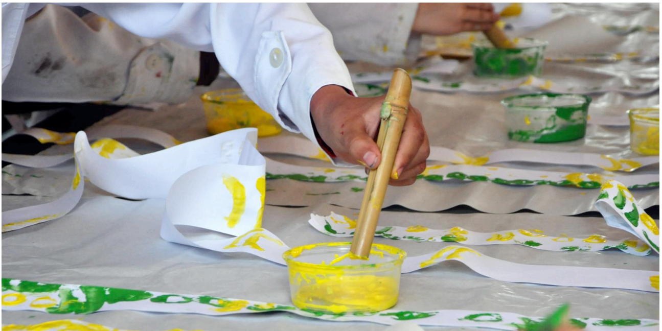
Figure 2 - Stamps with pieces of bamboo canes