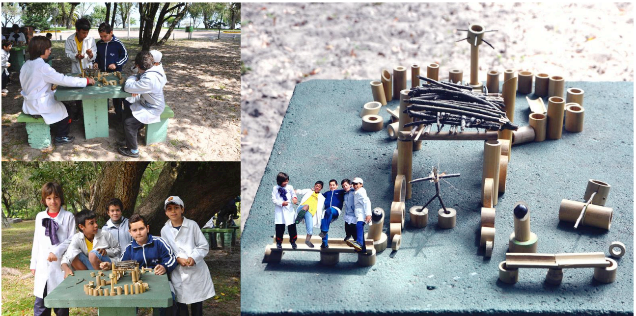
Figure 3 - Construction structures composition of different pieces