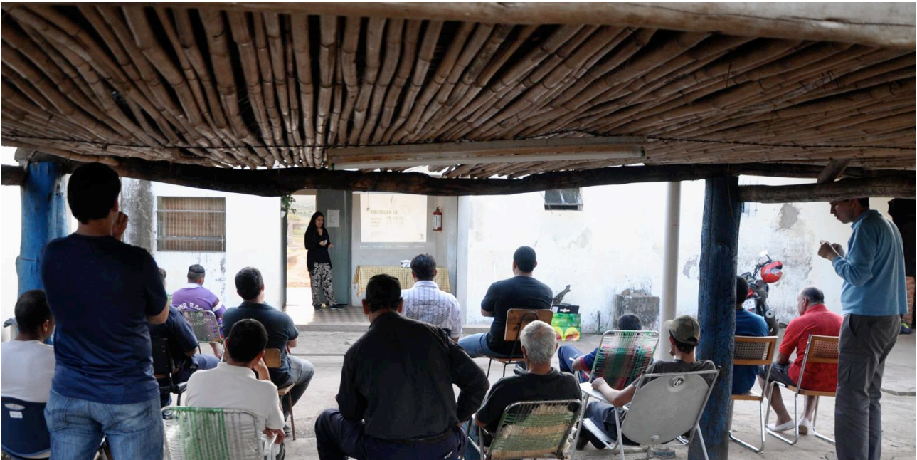
Figure 4 - Workshops with prisoners in rehabilitation