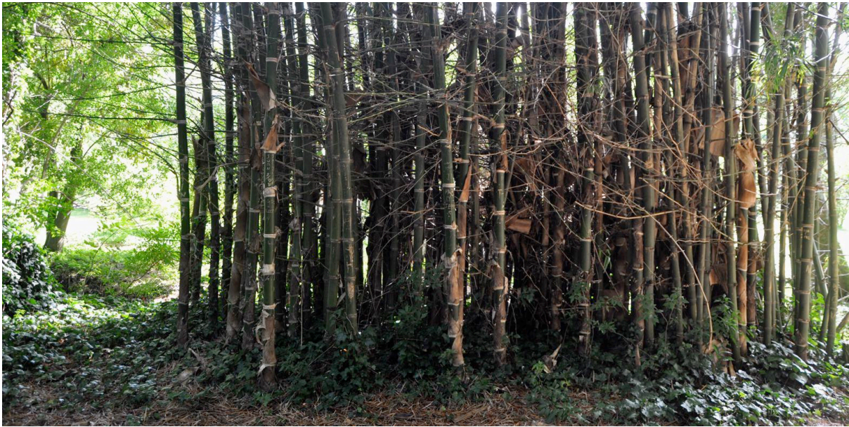
Figure 5 - Guadua Chacoensis at the Botanical Garden, also seen in Artigas